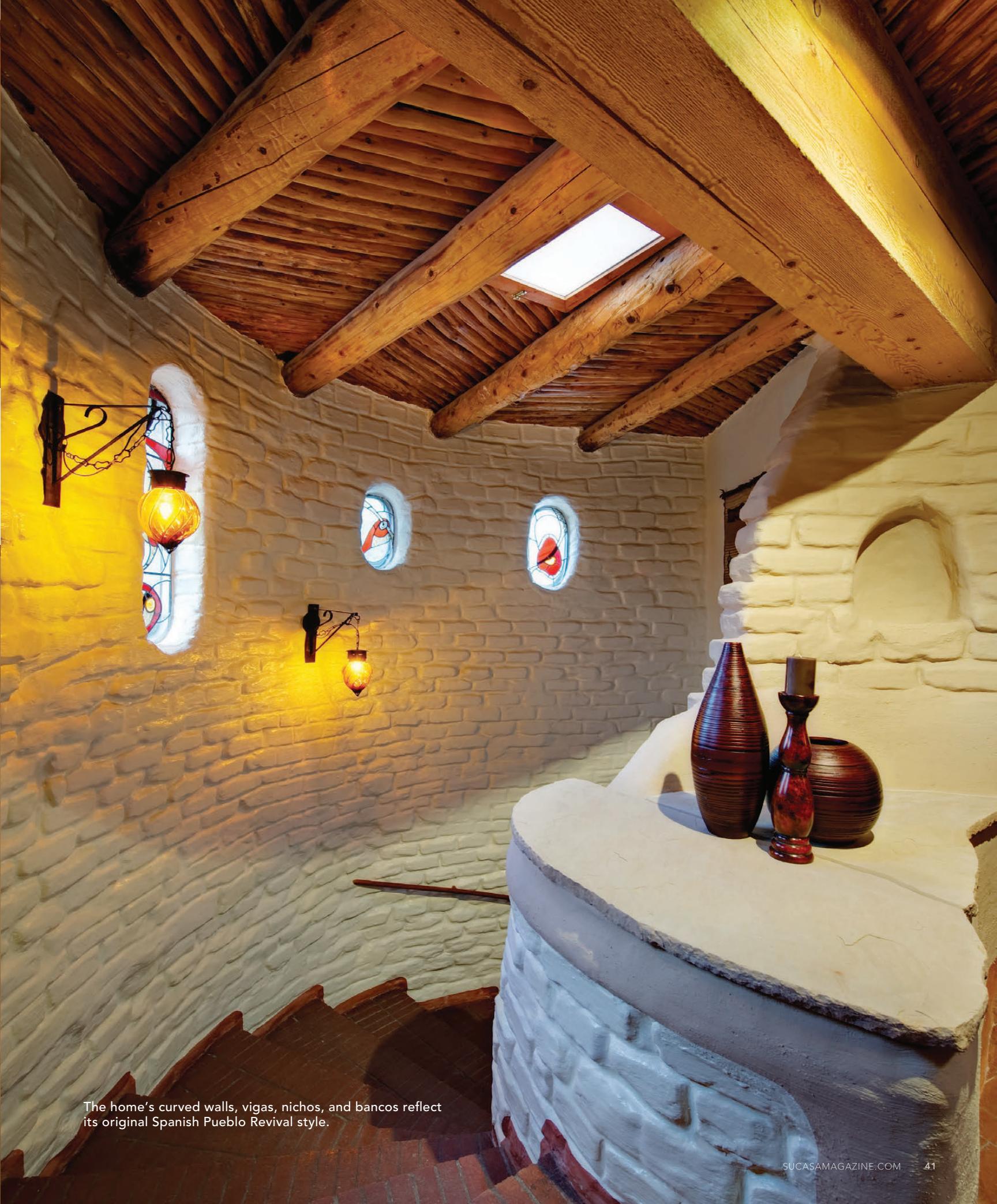
The home's curved walls, vigas, nichos, and bancos reflect its original Spanish Pueblo Revival style.